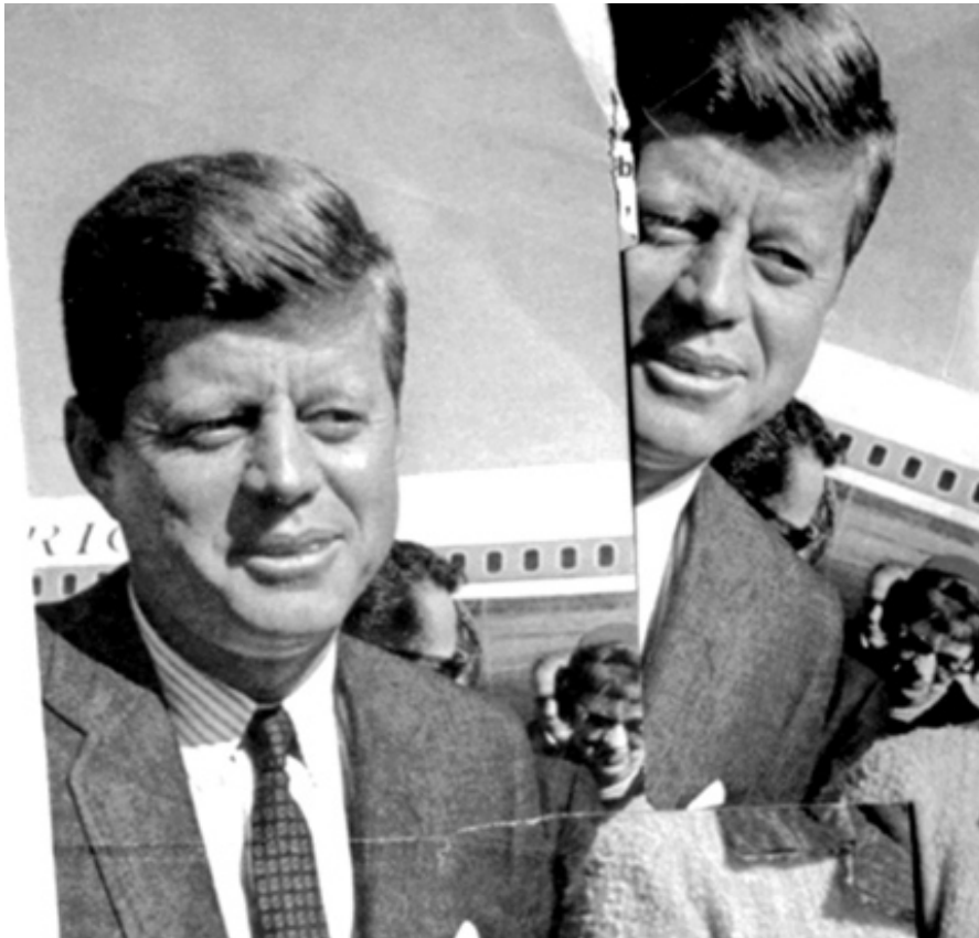
Archival material from Andy Warhol's collection of news clippings from 1963.