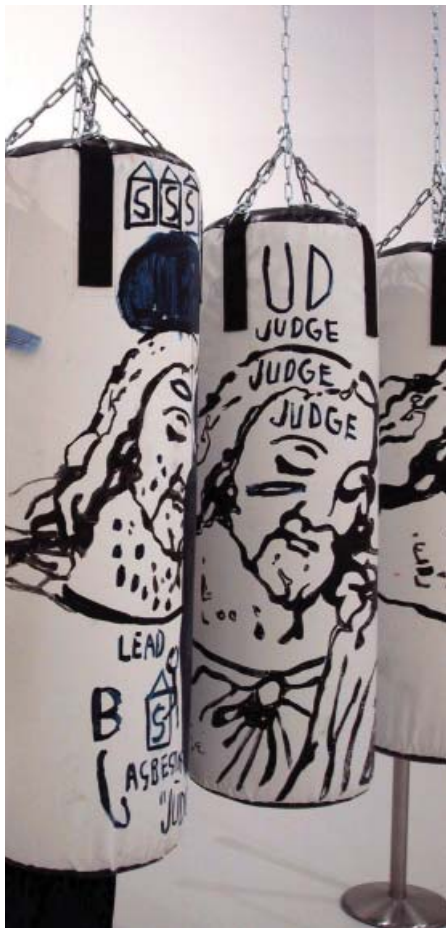
Detail, Ten Punching Bags (Last Supper), 1985-1986, The Andy Warhol Museum, Pittsburgh

Unit Lesson Plans / Critical Thinking / Collaboration / Lesson 3 / Handout 3.1