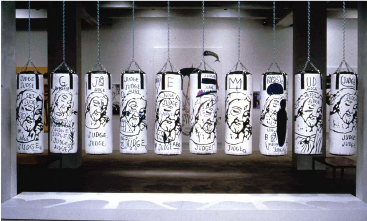
Andy Warhol and Jean Michel Basquiat, Ten Punching Bags (Last Supper), 1985-1986, Acrylic and oil stick on punching bags, 42 x 14 x 14 in. (106.7 x 35.6 x 35.6 cm.), The Andy Warhol Museum, Pittsburgh

"It was like some crazy-art world marriage and they were the odd couple. The relationship was symbiotic. Jean-Michel thought he needed Andy's fame, and Andy thought he needed Jean-Michel's new blood. Jean Michel gave Andy a rebellious image again."